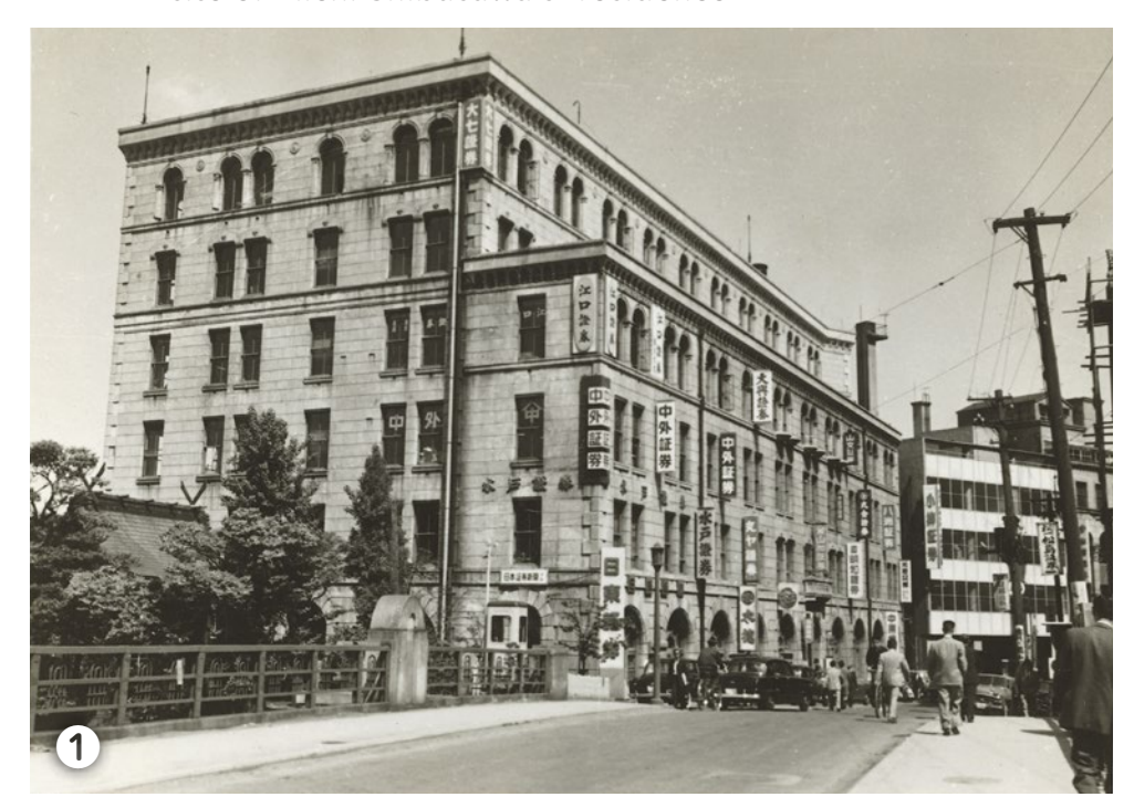
Nisshokan Building constructed on the former site of Eiichi Shibusawa's* residence