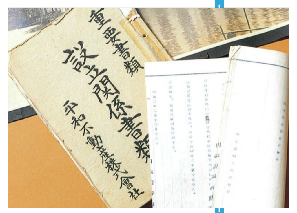
1947 Heiwa Real Estate Co., Ltd. established