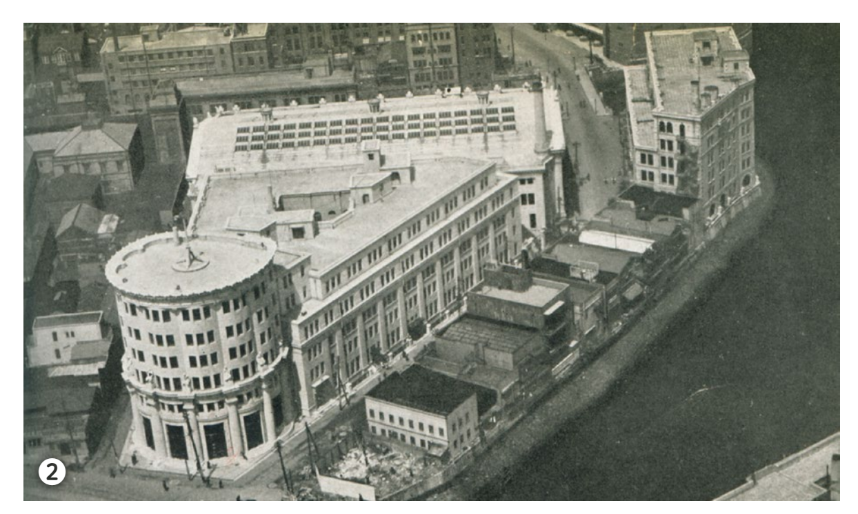
1943 Japan Securities Exchange established